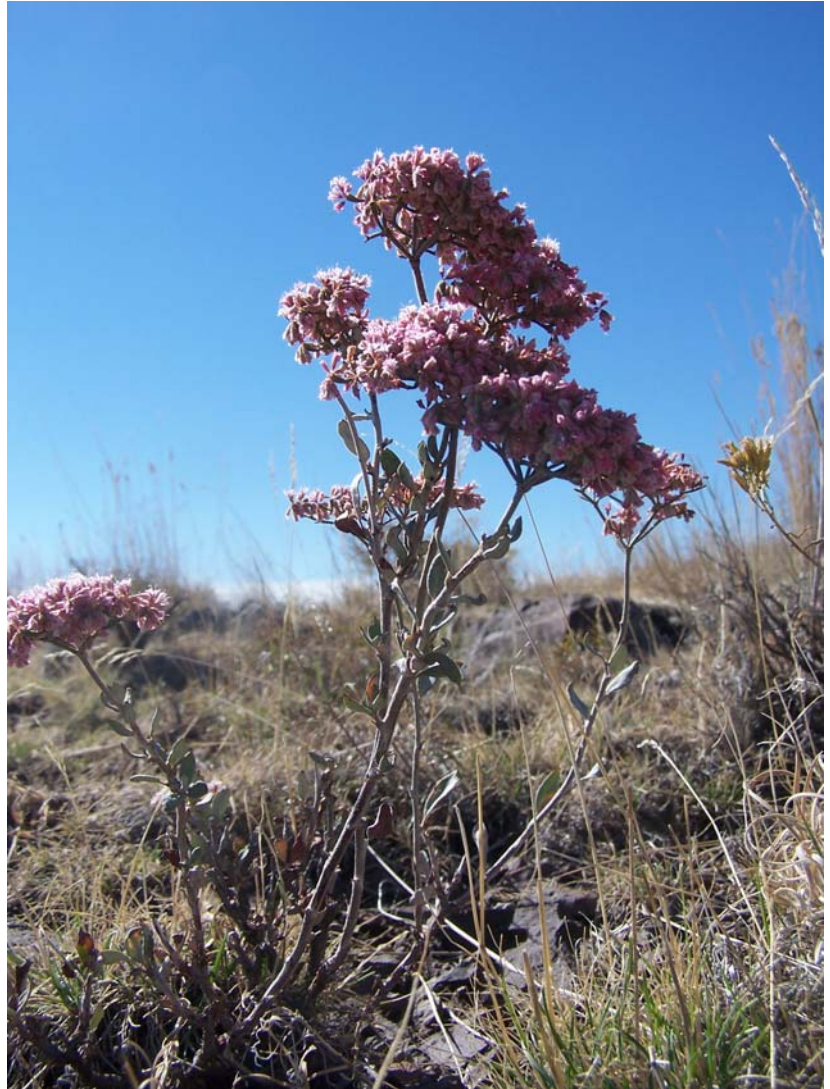
Eriogonum microthecum var. laxiflorum from the South Hills 6 Oct. 2006

The root name of the genus Polygonum, for which the family is named, translates to many 'kneed' or 'jointed,' referring to the swollen nodes found in most members of the Polygonaceae. In the Polygonaceae the stipules take the form of a membranous sheath, called an ocrea, which covers the vegetative nodes. Historically the term ocrea dates back to Greek and Roman times and refers to a piece of metal armor lined with cloth or leather.