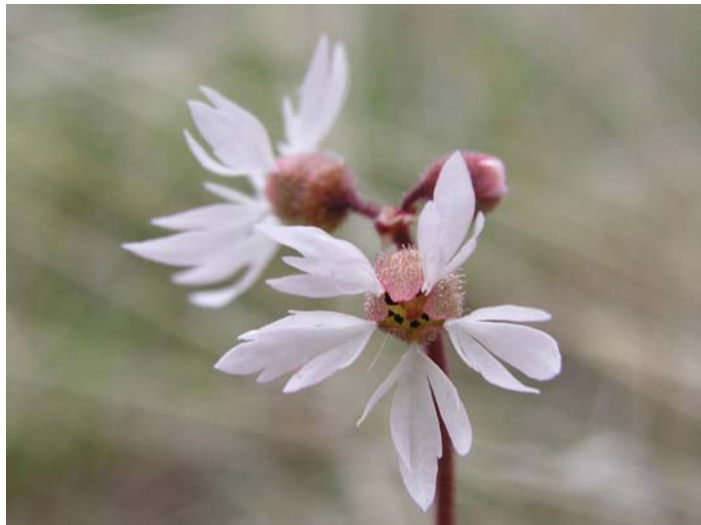
Prairie Star, Lithophragma Salmon Falls Creek 8-April-06

Last but not least, there seems to be a lot of confusion about plants that are poisonous in our area. Dylan's program for the evening will resolve these issues. So please come prepared to make decisions, volunteer, and learn.