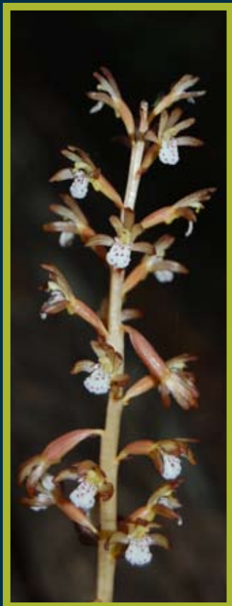
Spotted coral root ( Corallorhiza maculata ), a parasitic orchid, Elk Creek Middle Falls.