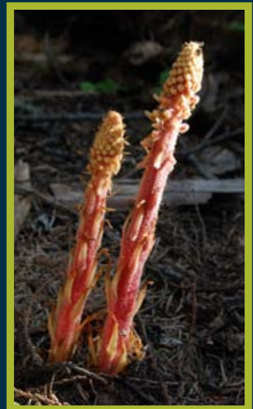
Parasitic pinedrops were photographed during the White Pine Chapter's field trip to Elk Creek Middle Falls.