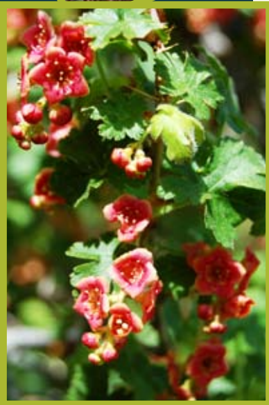
Top: Delphinium nuttallianum