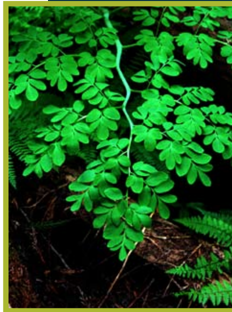
This zig-zag branch and delicate leaves of Case's corydalis ( Corydalis caseana ) are as beautiful as the flowers.

At the end of the hike, Pam presented a fine specimen of false hellebore ( Veratrum californicum ) and shared some fascinating information with us. The phytochemical cyclopamine found in this plant, which is responsible for major birth defects in lambs, is now being evaluated for treatment of many forms of cancer. It is currently in stage two testing for pancreatic cancer. What better reminder could we have regarding the importance of preserving native plants?