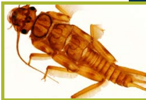
Stonefly: Doroneuria Theodora , a predaceous stonefly with a low tolerance for poor water quality, was collected by the group.

Moseley and Wellner (1991) reported the presence of two undescribed earthworms and beetles together with several coastal disjunct plant species in Aquarius RNA on the North Fork Clearwater River. We identified no new plant species or invertebrates over the short period of time at the Lochsa RNA, however workshop participants benefited from hands-on learning by participating in the field observations and collections.