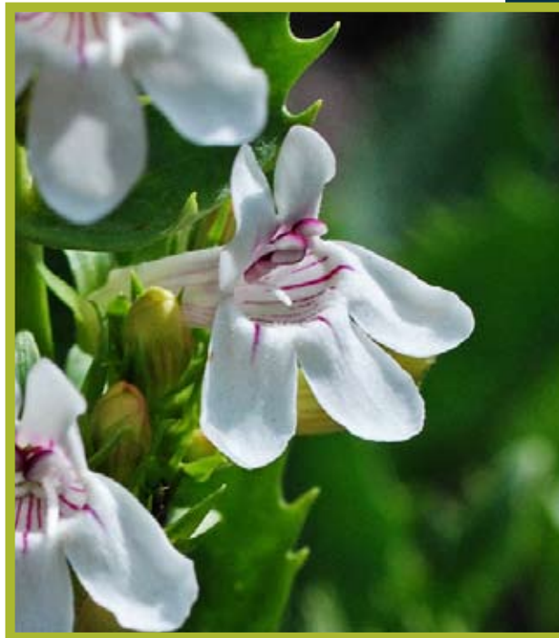
Penstemon deustus photographed at Hells Half-Acre during a Sawabi and Upper Snake chapter field trip on June 4.