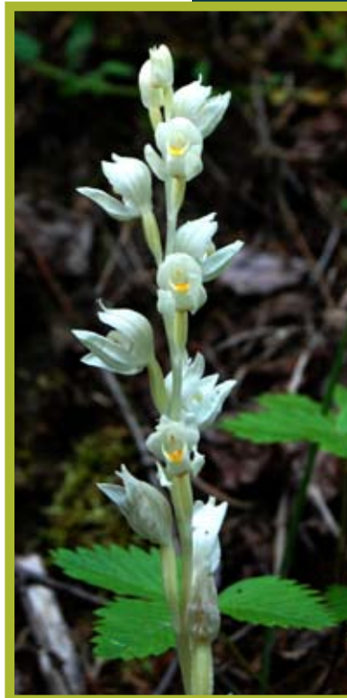
This phantom orchid ( Cephalanthera austiniiae ) is one of several types of orchids White Pine members found in the Giant Western Cedar Grove.