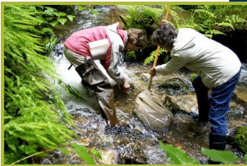
Aquatic macroinvertebrates were collected from high water in Apgar Creek. The invertebrates were later identified using microscopes set on picnic tables in the campground.