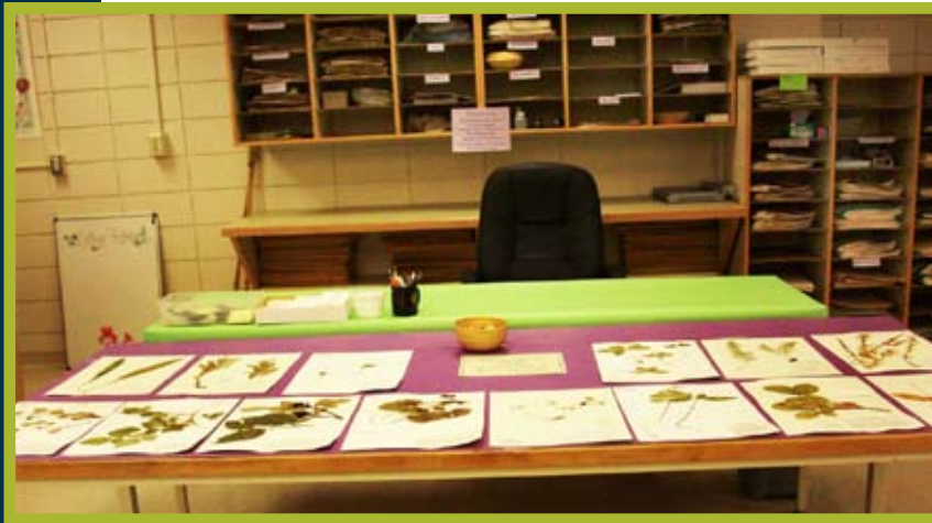
Above: Herbarium working area and shelving units.

For more information on the herbarium please visit the website http://www.uidaho.edu/herbarium or drop by Room 22 in the College of Natural Resources any time. Free bookmarks and candy are always available.