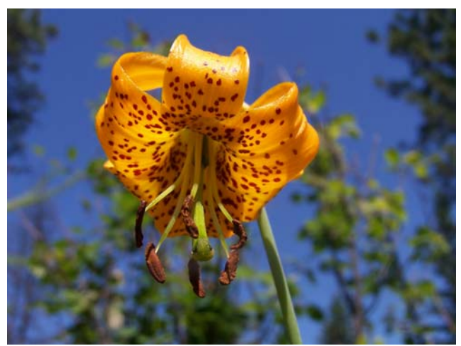
Lilium columbianium , Farragut State Park, Idaho June 24, 2006

Room 258 of the Taylor Building at CSI 7-9 pm