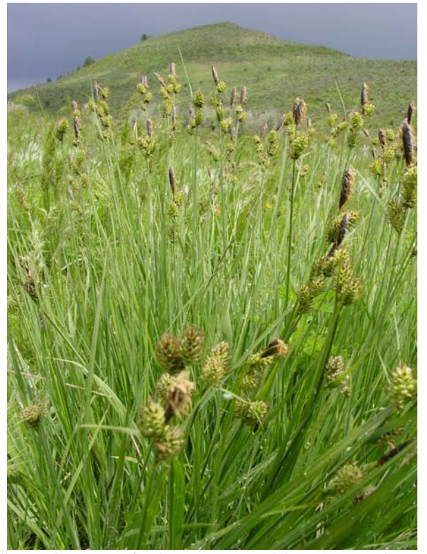
Carex aboriginum (Indian Valley sedge) endemic to the Indian Valley area of Adams County, Idaho