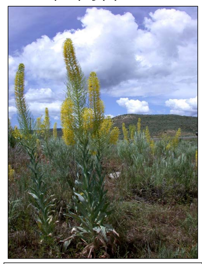
Stanleya confertiflora

Analyses of monthly precipitation patterns, life history traits, and population responses since October, 1999 revealed that high levels of soil moisture are most important for non-reproductive Stanleya populations in the fall and spring, which promote germination and establishment of deep-rooted rosettes capable of living beyond their first year. For years when the populations are largely in flower, rainfall during spring and summer is more critical, to facilitate bolting and a longer reproductive period for seed maturation. And as might be expected, the size of seedlings is correlated with later reproductive success – juvenile plants were more likely to survive to become flowering individuals if they were larger, underscoring the likely relationship between adequate rainfall for first year plants and the probability of ultimately flowering and setting seed. This pattern was disrupted, however, if seedling plots were exposed to grazing.