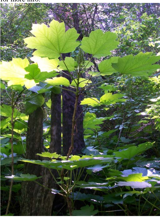
Definitely NOT Crater of the Moon. This gnashing beast, Oplopanax horridum, was on display at the 2006 INPS Annual Meeting, Farragut State Park. An equally stunning flora awaits your company at the 2007 Annual Meeting. Start your summer off right. Make plans to attend.

Mark your calendars! Check out the next issue (May) for more info.