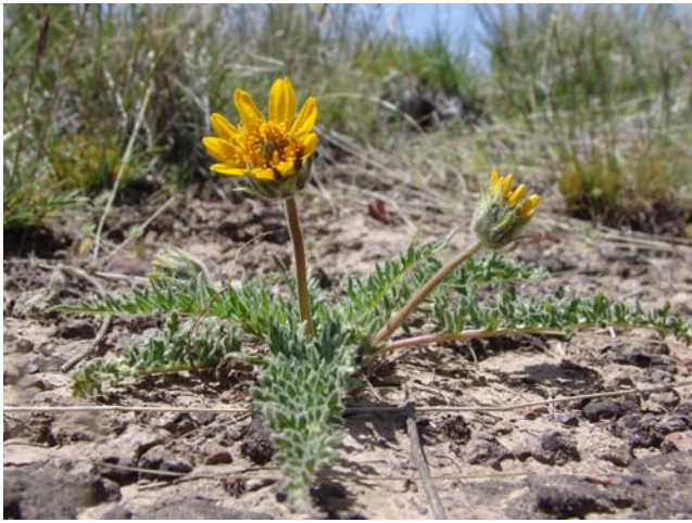
In the depths of winter a little dose of Balsamorhiza hookeri, goes a long way toward warming the day. From Cherry Springs, on the Burley BLM