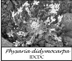
Physaria didymocarpa

CHALLIS is located in the Lemhi Valley where the Lewis & Clark party first entered present-day Idaho after crossing the Continental Divide. Challis is one of the most arid places in Idaho and has an active geologic history. These factors may contribute to the numerous endemic plant species in the Challis area, also known as the CHALLIS ENDEMIC S.