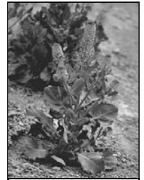
Thelypodium repandum IDCDC

We will explore the Challis area and hopefully encounter the following Challis endemics: Challis crazyweed ( Oxytropis besseyi salmonensis ), Challis milkvetch ( Astragalus amblytropis ), Lemhi milkvetch ( Astragalus aquilonius ), Salmon twin bladderpod ( Physaria didymocarpa var. lyrata ), wavy-leaf thelypody ( Thelypodium repandum ), and Welsh's buckwheat ( Eriogonum capistratum var. welshii ).